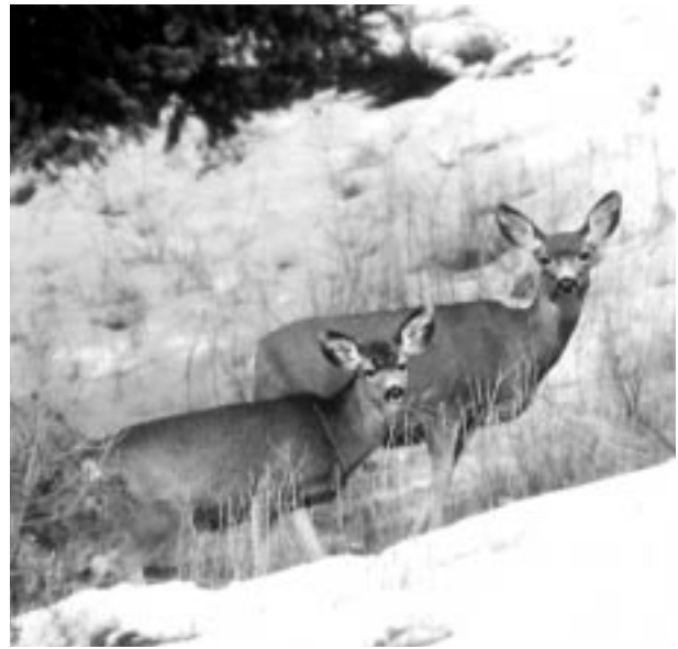
MAINTAINING BOTH WINTER AND SPRING RANGE IS CRITICAL TO THE LONG TERM CONSERVATION OF MULE AND BLACK TAILED DEER IN BRITISH COLUMBIA.

Several thousand Mule and Black-tailed deer die each year on British Columbia roads and highways, and deaths will undoubtedly increase with increased traffic and new highways. This is a serious problem,