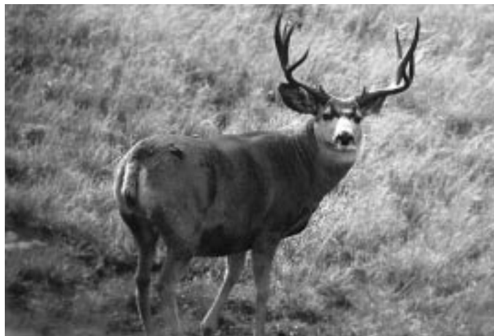
MULE DEER ARE MOST COMMONLY FOUND IN THE DRY VALLEYS AND PLATEAUS OF THE SOUTHERN INTERIOR. David F. Fraser

Black-tailed Deer have been around in North America for over two million years. Mule Deer may have appeared later as a hybrid of Black-tailed and White-tailed deer. Since then, at least seven races or subspecies of Mule and Black-tailed deer have developed. When ice covered British Columbia 18,000