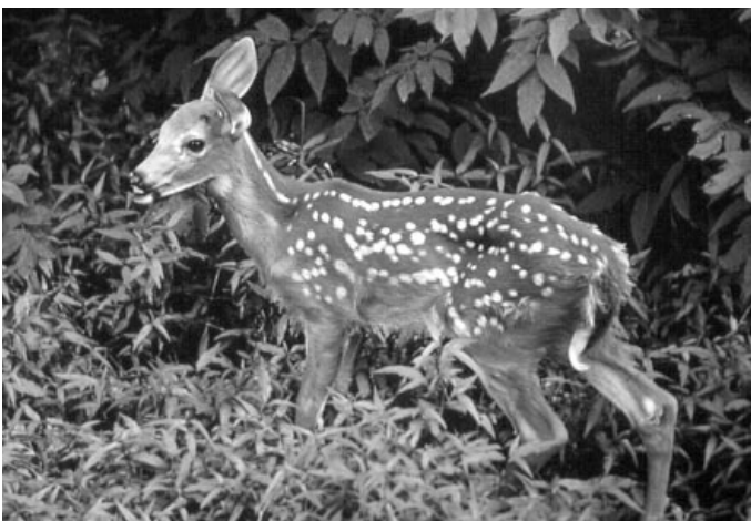
THE FAWN RELIES ON ITS CONCEALING COLOURATION, LACK OF SCENT, AND SILENCE FOR PROTECTION Sean Sharpe

Mule and Black-tailed deer numbers ... can increase greatly where forest fires, logging or other disturbances create openings where food plants are abundant.