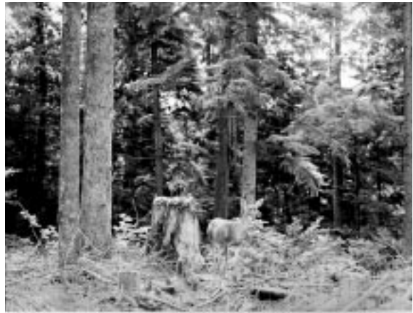
BLACK-TAILED DEER OCCUR ALONG THE ENTIRE COAST OF BC AND MAKE FREQUENT USE OF LOGGED HABITATS DURING SPRING AND SUMMER. BC Gov.

Thousands of casual contacts between people and deer have considerable intangible value.